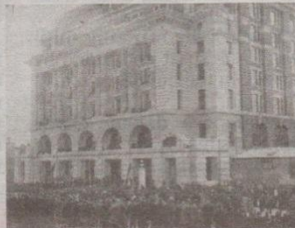
Official opening: 1923.

across the road into one of the vacant retail spaces on the outside of the Perth train station.