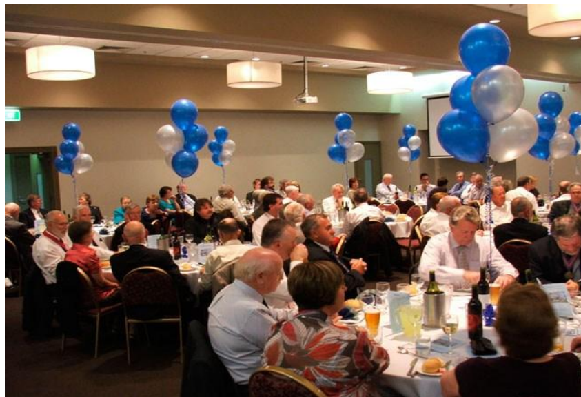
Some of our Members at Canberra (can you spot who)