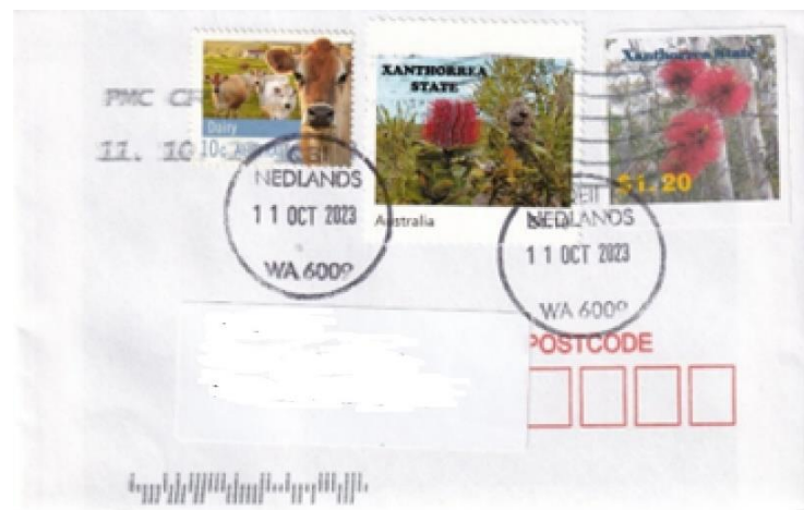
Australia – Xanthorrea State combination which includes an Australian Xanthorrea State P-stamp as well as the local issue

Examples of these include use of Lady Gowrie stamps, philatelic exhibition stamps and similar Cinderellas. Lines get blurred in cases of private posts such as the Lundy Island posts of the UK, Rattlesnake Island in the USA and Hutt River Province, Bumbunga and the Xanthorrea State posts of Australia, all of which are providing limited postal services before the mail interacts with a UPU recognised postal authority.