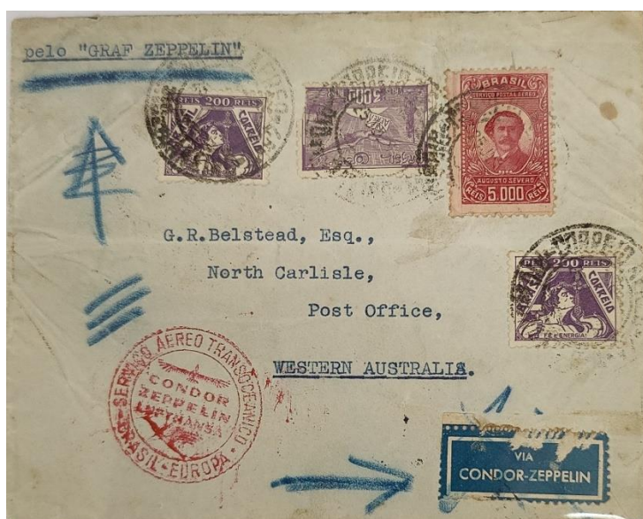
Brazil to Perth, Western Australia; 25 June? (year indistinct).

Many who viewed it conjectured that it may well be the only one in existence. Nobody admitted to having seen another to Western Australia, as a destination. A truly rare piece.