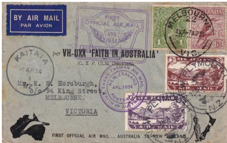
Australia-New Zealand combination on first flight cover from 1934.

The most commonly seen examples of combination postage are on postage due covers. Where the sender has not fully paid the postage, this can be picked up by the despatching post office and postage due markings applied and when the cover is delivered to the recipient the unpaid postage (plus a fee) can be collected from them. This was commonly done using postage due stamps. These result in a combination cover with stamps of the postal authority of the sender and, at the other end, stamps of the postal authority of the recipient.