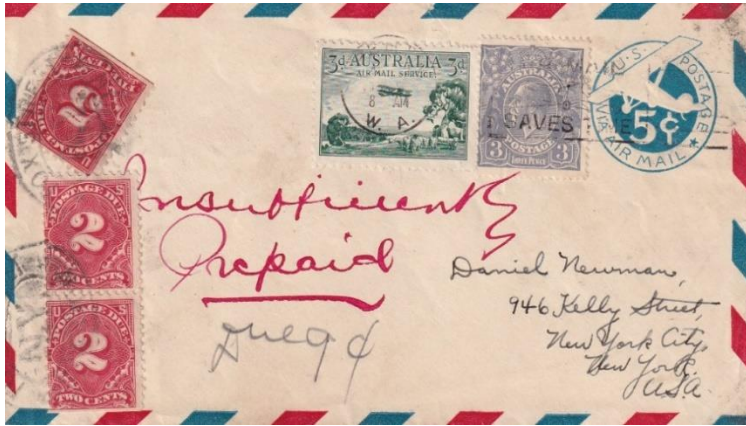
1929 combination cover of US postal stationery envelope, franked with correct airmail for Perth-Adelaide by airmail and foreign postage from Australia to USA, but deemed insufficient for US cross country airmail, so tax and postage dues applied.

Another form of combination can occur where stamps nominated for a particular state are also valid in other states within a country. The stamps of the various states of Malaysia are valid within all of Malaysia, so that while the stamp may bear the name of one state, it can be used in any of them. This can lead to stamps from multiple states all being used together on the one cover or parcel.