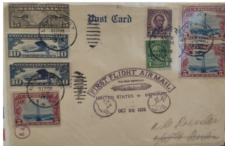
The offending 1 Cent Franklin on the complicit card.

He was arrested by the postal authorities for his free-thinking impertinence.