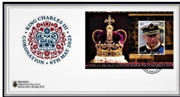
The Bermuda limited edition First Day Cover bearing the $6.00 Coronation issue

In addition, Bermuda had previously issued a $35 Commemorative stamp, in March 2023, to mark the Coronation.