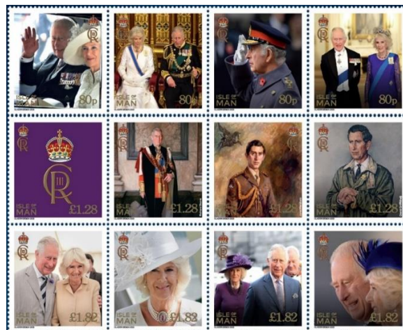
Isle of Man's set of twelve Coronation stamps

The Isle of Man celebrated King Charles III's Coronation with a set of 12 stamps featuring a mixture of images of the King and Queen Consort, along with portraits of His Majesty and his Royal Cypher.