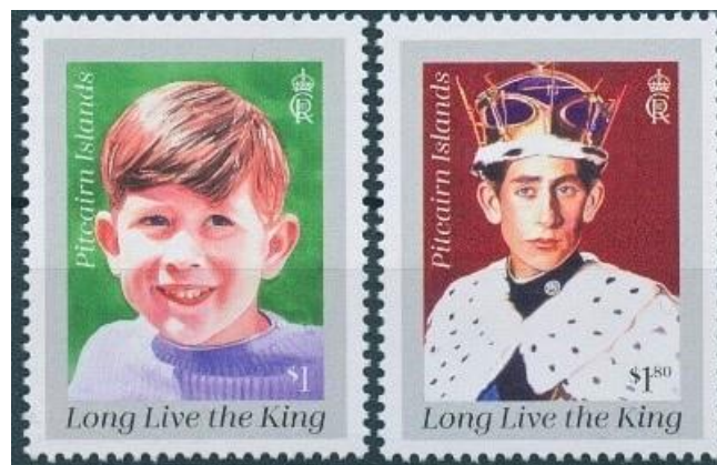
As a young boy

Each stamp featured an image of the King at a particular time of his life before his Coronation.