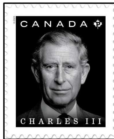
Canada's King Charles III definitive

The issue also includes a booklet of ten domestic rate stamps and an Official First Day Cover. The stamp is nondenominated, paying the permanent rate for domestic letters weighing up to 30 grams