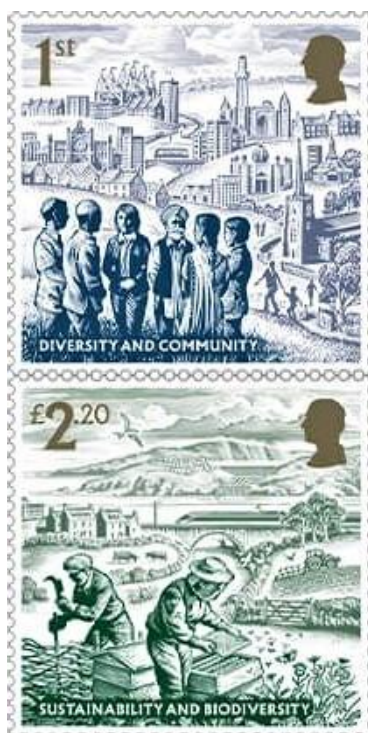
Diversity and Community (top) and Sustainability and Biodiversity (bottom)

The other two stamps, which reflect issues that are close to King Charles' heart. 'Diversity and Community' and 'Sustainability and Biodiversity', make up the set.