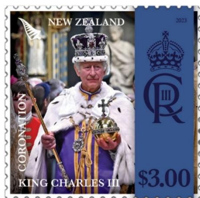
The $3.00 Coronation from New Zealand's set of six