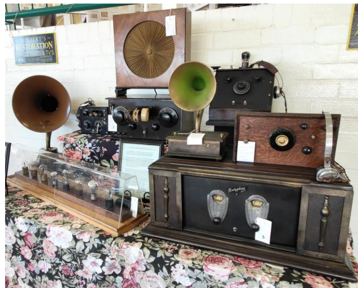
The Norbert's TV Service (Mandurah) display of antique radio receivers at Perth 2023

November 2023 marked the Centenary of radio broadcasting in Australia. This historical occasion was marked at Perth 2023 with an interesting display of antique radio equipment courtesy of Norbert's TV Service (Mandurah).