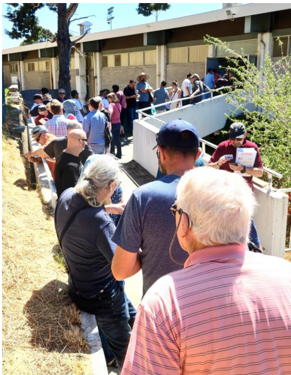
Perth 2023 - The APO queue patiently waiting for the appointed hour on Friday 3 November

The Australia Post stand was a particular point of attraction with its broad range of material and limited-edition bargains. The AP queues were long on all days as collectors waited patiently for the appointed time to arrive when they could purchase the limited editions at the best price.