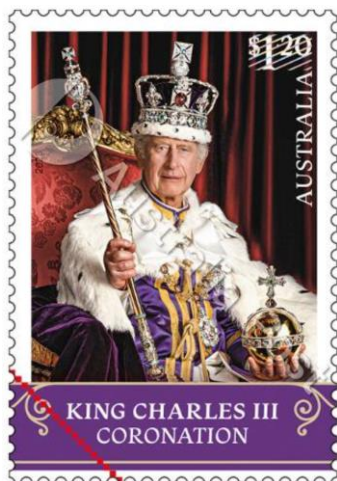
The 2023 $1.20 Coronation Commemorative

As Australia Post writes in Stamp Bulletin No 386, “The crowning of a sovereign is an ancient ceremony steeped in tradition and consists of the recognition, the oath, the anointing, the investiture and crowning, the enthronement and the homage. The King made the solemn vow to serve God, and the people of the nations within the realms” .