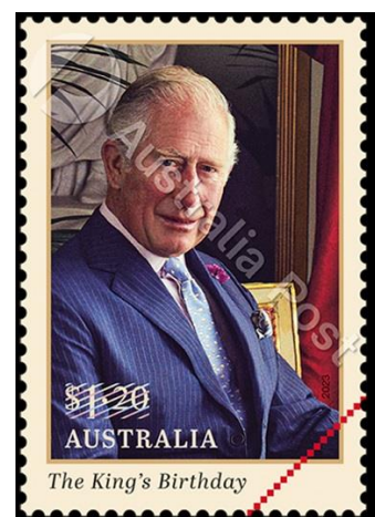
Clarence House, Garden Room – 2018

The second captures a 2018 image of King Charles seated at his desk in the Garden Room at Clarence House, London (not Clarendon House, as Australia Post asserts).