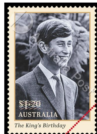
$1.20 Timbertop bound - 1966

Two stamps, both with face value of $1.20, were issued in celebration. The first comprised an image King Charles as a youth on arrival in Sydney to attend Geelong Grammar School's Timbertop campus in Victoria in 1966.