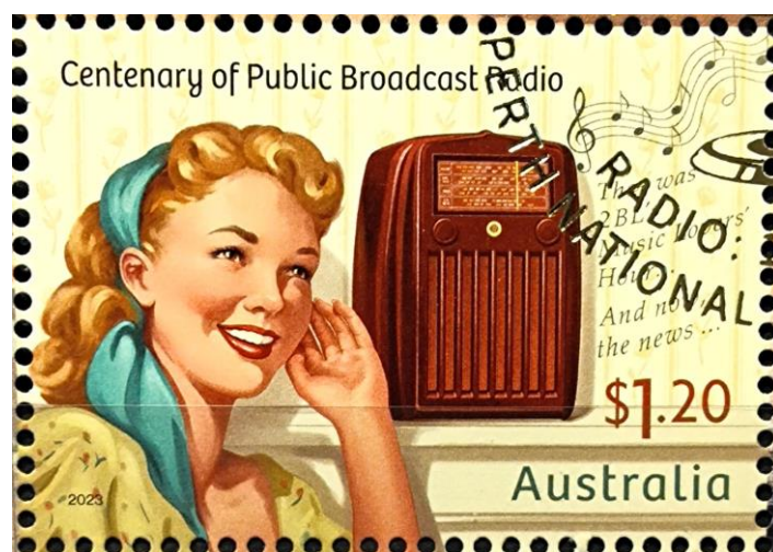
The $1.20 Radio Centenary stamp carrying the image of the AWA Fridge Radio model and bearing a Perth 2023 National Stamp Exhibition commemorative cancel

The radio image on the Centenary of Public Broadcast Radio stamp is of the iconic AWA Fridge Radio model 520M or 521M from 1949-50.