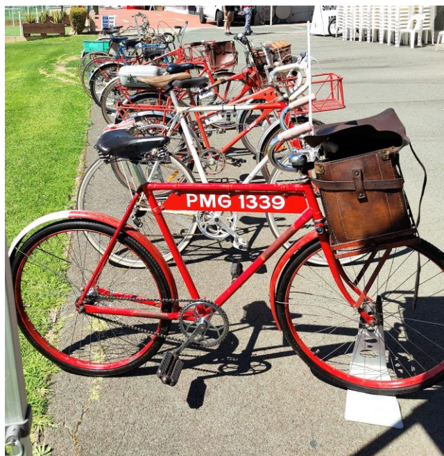
WA Historical Cycle Club's display of Postal bikes at Perth 2023