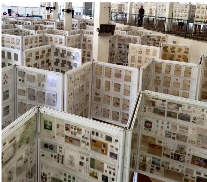
Exhibition Hall – Perth 2023 – Gloucester Park

Some 600 frames were exhibited with international entries from the UK, Pakistan, Dubai, New Zealand, Sweden, and Sri Lanka. All states of Australia were represented by exhibitors, along with the Australian Capital Territory.