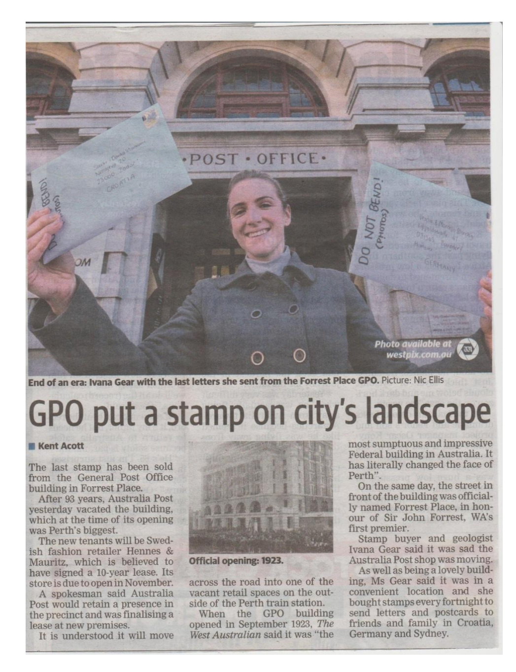
An article from the West Australian Newspaper