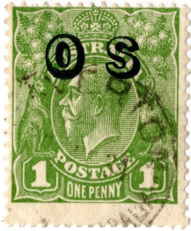
Lot 133 Front