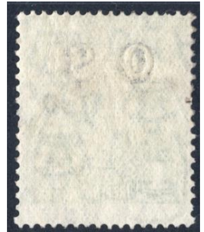
Lot 133 Reverse