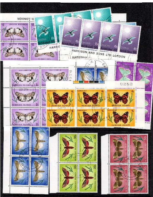
Lot 513 part