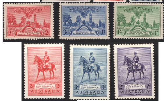
Pt Lot 444