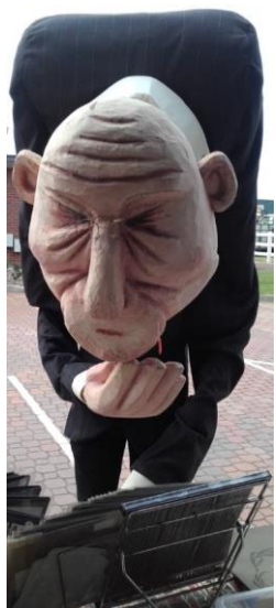
The Stamp Collector